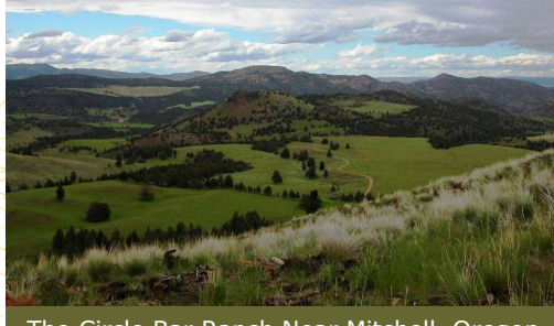
The Circle Bar Ranch Near Mitchell, Oregon is a traditional ranch of about 5,000 acres, running about 150 cow/calf pairs.

treatments and level of commitment needed in restoring medusahead-infested land. It is a cautionary tale to those whose lands don't have medusahead: Do all you can to prevent it from establishing on your lands. However, it is also a tale of success in that ranchers don't have to throw their hands up if medusahead is already infesting their rangelands. Restoration, though expensive, is possible.