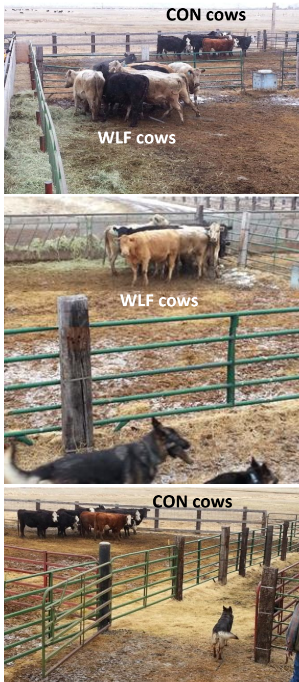
Figure 1. Behavioral responses of beef cows during the simulated wolf encounter.

predated by wolves immediately adopt a fear-related protective behavior after perceiving signs of wolf presence, whereas the same outcome may not be observed in cattle unfamiliar with wolves.